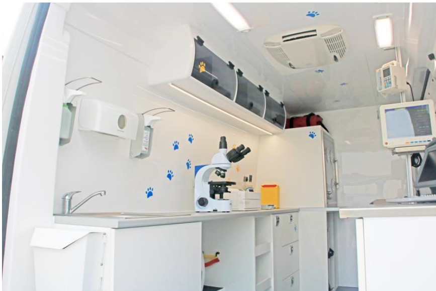
Image 2: A potential design for the PRU. Image sourced from Deltamed in Romania.

https://www.deltamed.ro/product/veterinary-ambulance/ .